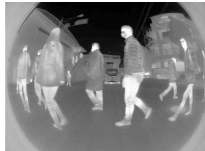
Sample Image : 3.8mm f/1.25 with 12μm VGA

Contacts : CBC Co., Ltd. IO Div. Tel: +81-(0)3-3536-4586 Mail: mishima@cbc.co.jp